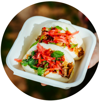
GOLDEN KATSU 'CHICKEN'

Our signature hero. Cloud-soft, pillowy bites designed to be experienced your way - elegant as canapés or indulgently savoured as a beautifully composed main.