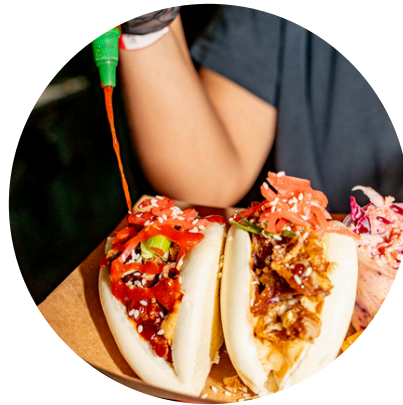
CRISPY UMAMI MUSHROOM

All served with black bean mayo, pickled pink ginger, sliced cucumber, spring onion, crispy shallots, toasted sesame, and just a dash of sriracha.